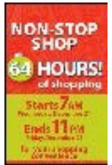
Line Sign Associate Ribbons