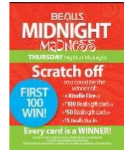
Poster Side A